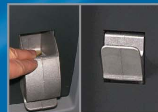
SAFETY COIN RETURN