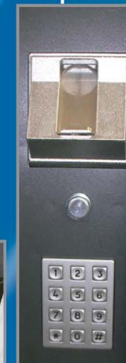
SAFETY COIN INSERT