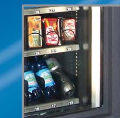
DOUBLE TEMPERED GLASS